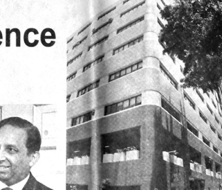
Philip Poon Dental Hospital at the teaching nucleus of the HKU Faculty of Dentistry